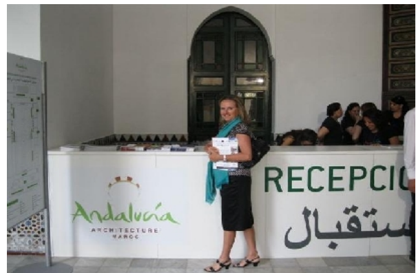
We-Design / We- Equip's manager in Tangier.

Last June, CITMA organized the "Architect's meeting day" in Tangier, Morocco. Company We participated very successfully in the event in order to strengthen the actual and make new possible relationships and partnerships with our neighboring country.